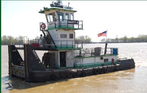
M/V Marty B.