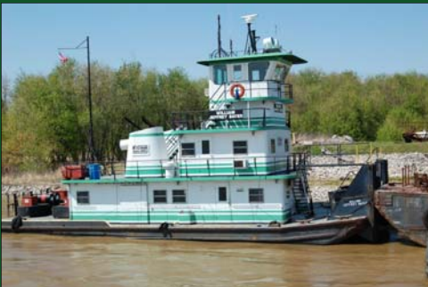
M/V William Jeffrey Bayer