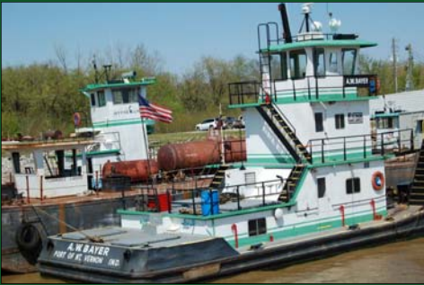
M/V A. W. Bayer